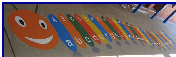
The alphabet caterpillar will be one of the new playground markings—others will include handball courts, snakes and ladders and a compass to indicate direction

We will have a number of bright playground markings and games painted in the near future and they will not only brighten up the school but also provide valuable learning tools, particularly for students in K-2. Finally, we hope to have a chookyard built to allow us to recycle food waste as well as collect the eggs for different cooking projects.